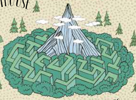
THE LABYRINTH OF DESIRES