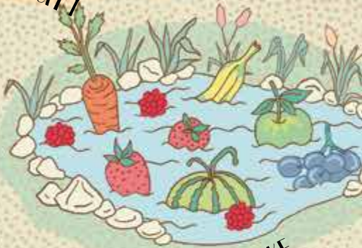
THE HIDDEN LAKE