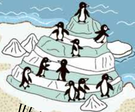
THE ICE ARENA