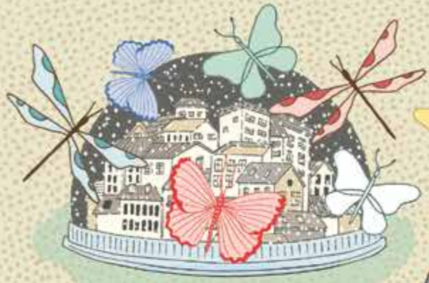
THE CITY OF BUTTERFLIES