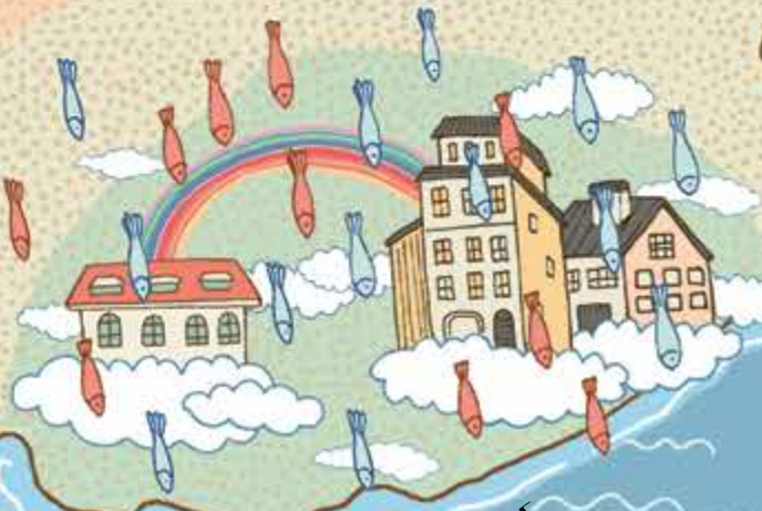
THE CAPE OF FLYING FISH