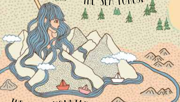
THE PAPER MOUNTAINS