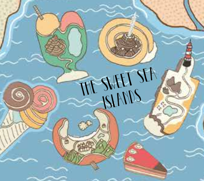
THE SWEET SEA ISLANDS