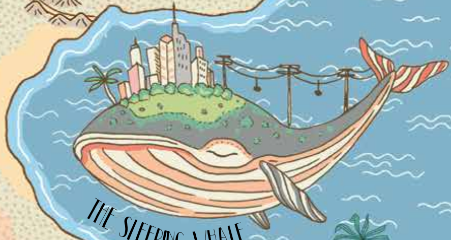
THE SLEEPING WHALE