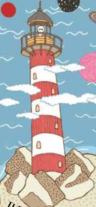
THE TALLEST LIGHTHOUSE