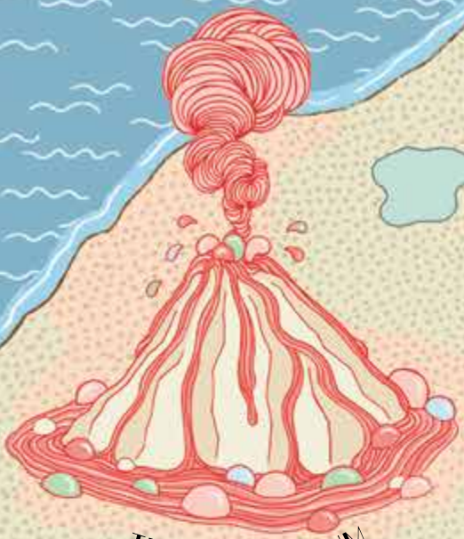
THE BUBBLE GUM VOLCANO