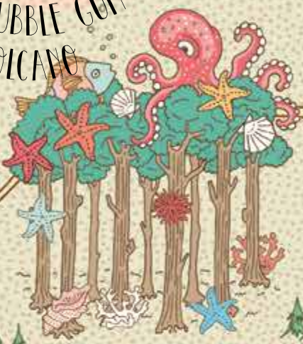
THE SEA FOREST