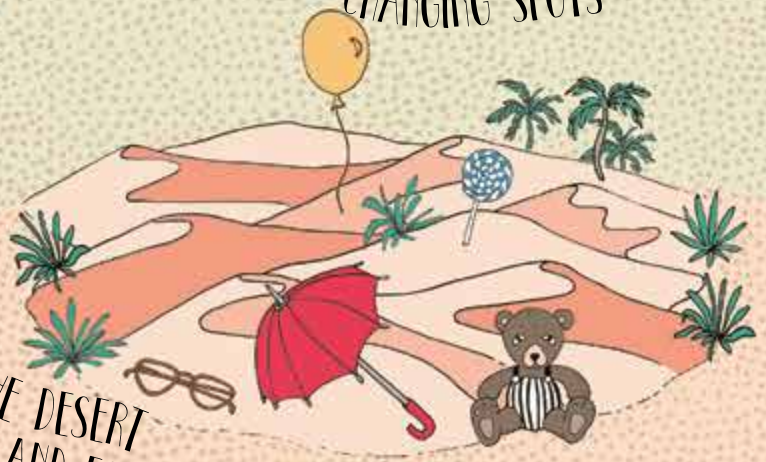
THE DESERT OF LOST AND FOUND