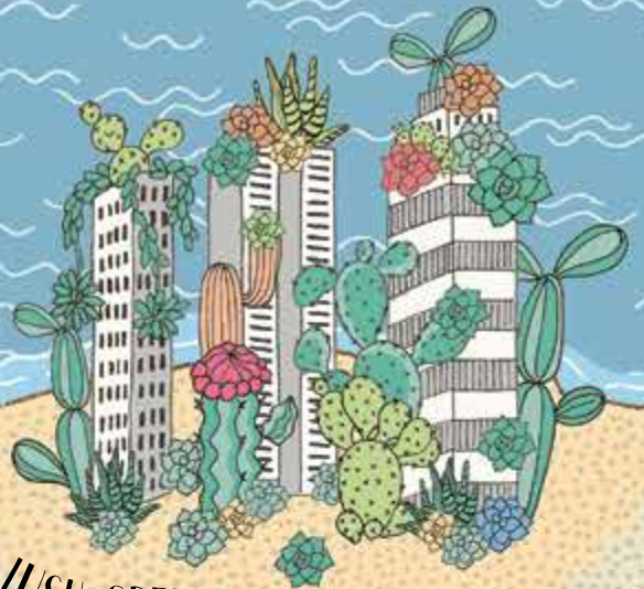
THE LUSH GREEN CITY